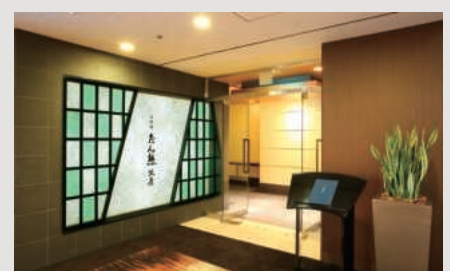
6F Japanese cuisine Tankuma Kitamise